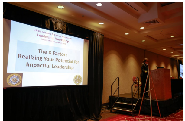
RADM Sylvia Trent-Adams, PDASH giving the closing keynote address