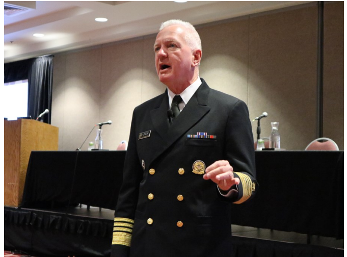
ADM Brett P. Giroir, ASH, providing the opening keynote address