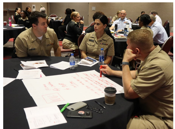
Junior Officers constructing their “wildly important goal”