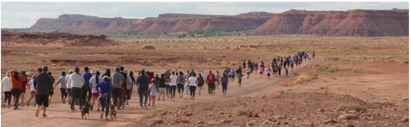
Racers are starting the Tuba City Surgeon Generals 5k